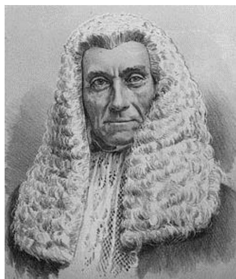
John Hubert Plunkett