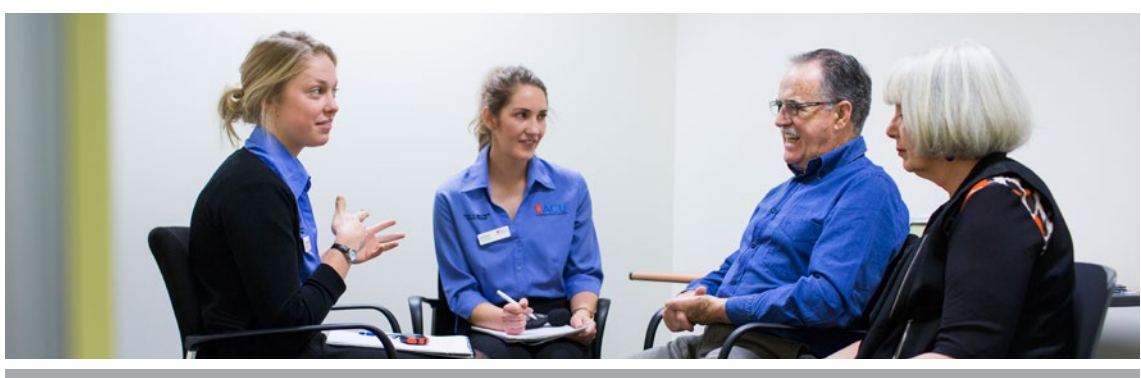
ACU students, Melbourne Campu