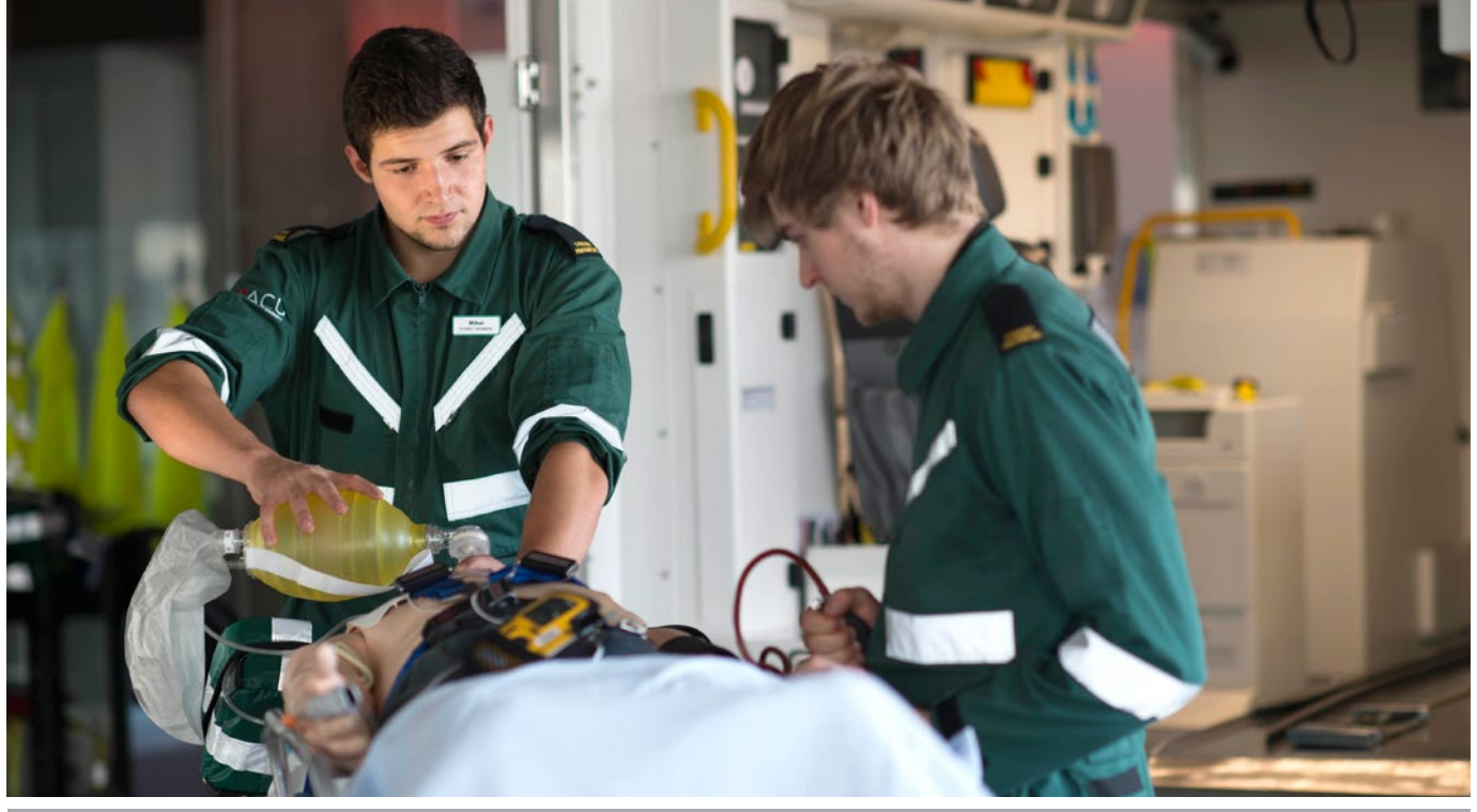
Paramedicine students, Melbourne Campus