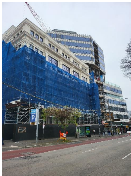
MGB Heritage Façade works