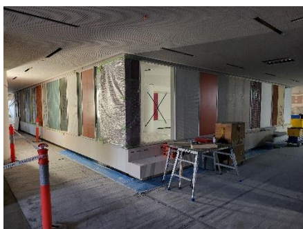
Level 1 Corridor Works Progressing