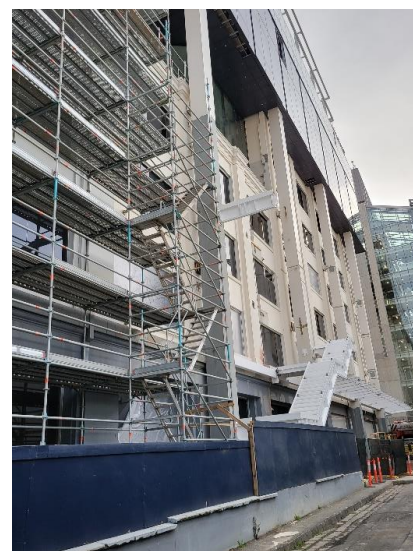
Little Victoria St Fire Escape Stair Installation