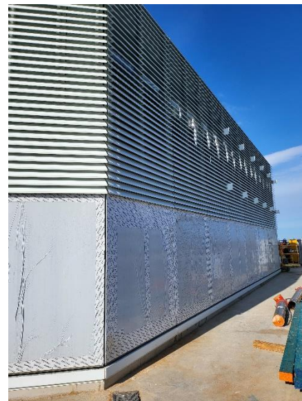
Level 12 Plantroom Louvres