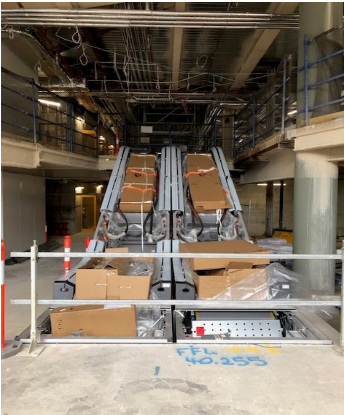
STKB First Escalator Install