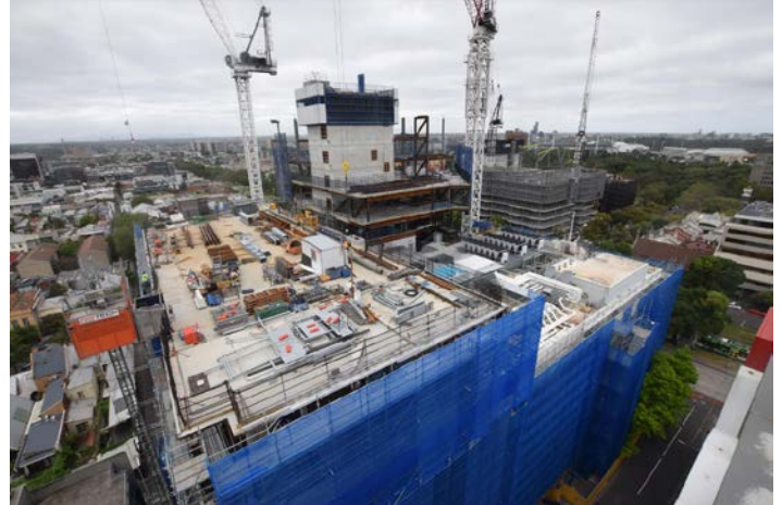
View from Camera 2