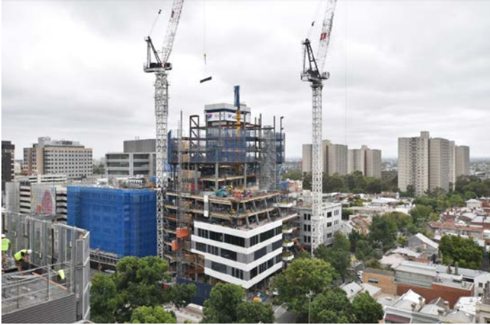
View from Camera 1