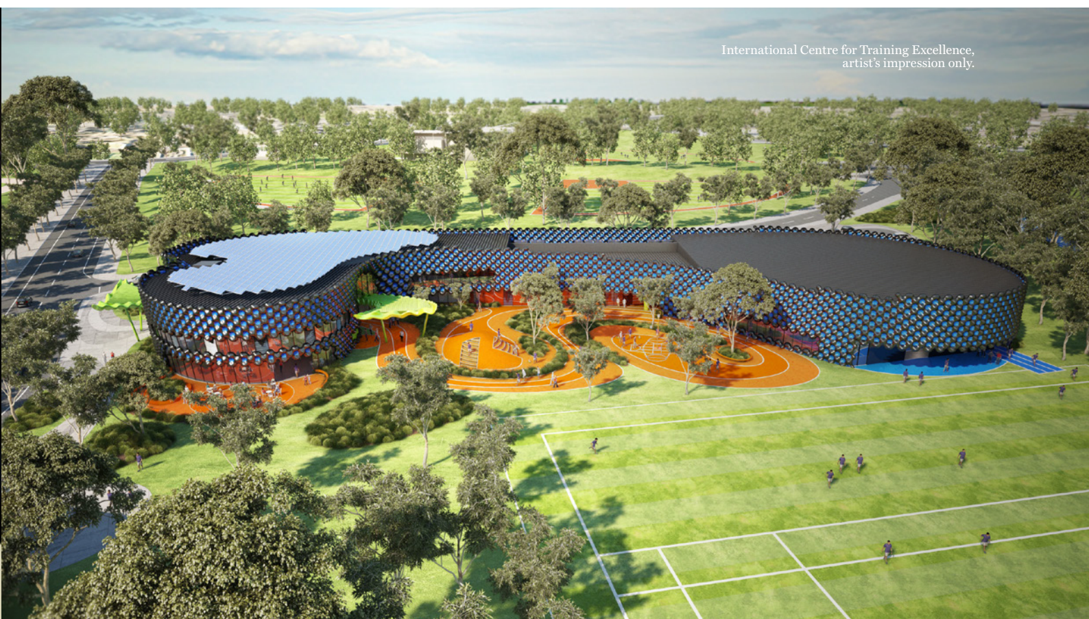
International Centre for Training Excellence, artist's impression only.

2021 - Undergraduate, postgraduate and pathway courses commence.