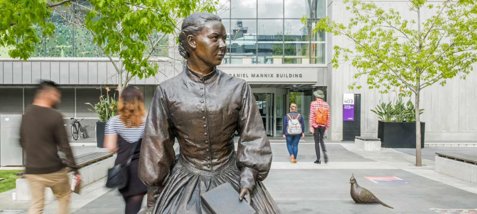
Mary MacKillop, ACU Melbourne