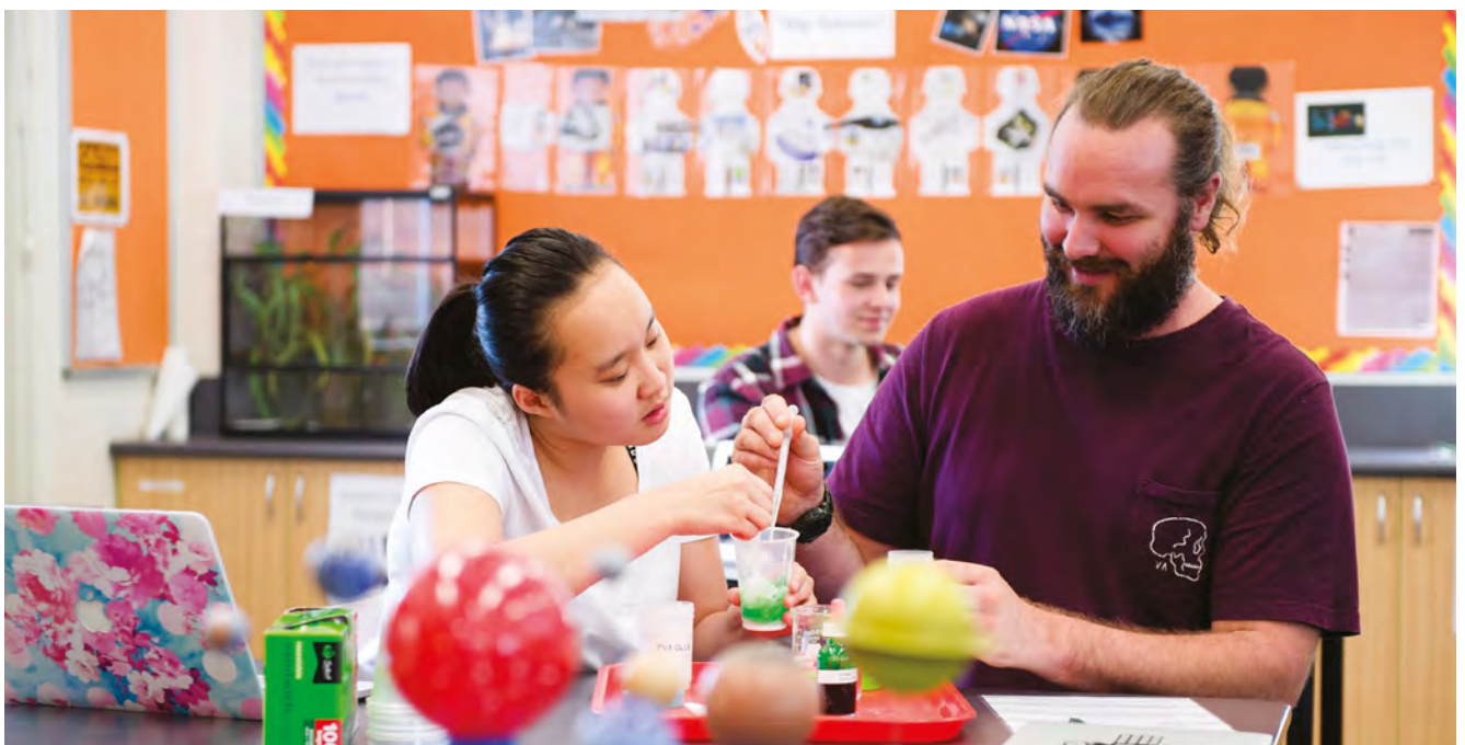
ACU Strathfield Campus