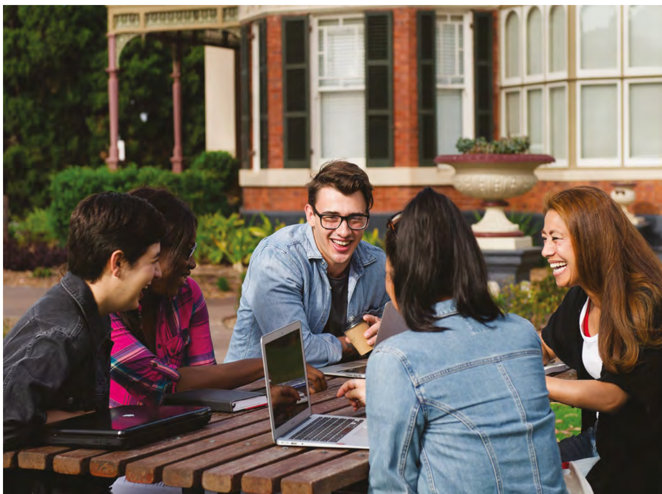
ACU Strathfield Campus

Further information: For the latest information about this course, please refer to: acu.edu.au/courses/bpsbess