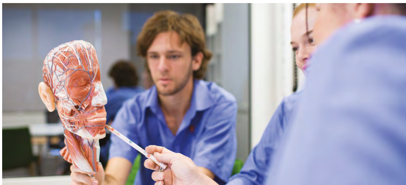
ACU Brisbane Campus