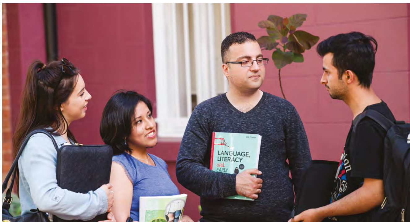
ACU North Sydney Campus

Further information: For the latest information about this course, please refer to: acu.edu.au/courses/bep