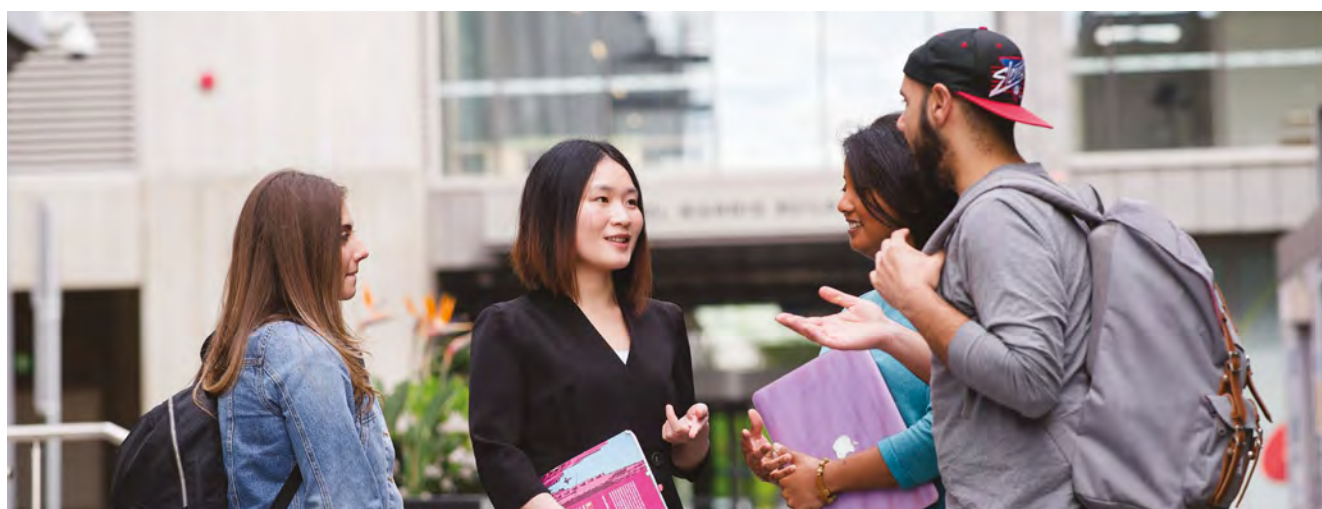
ACU Melbourne Campus