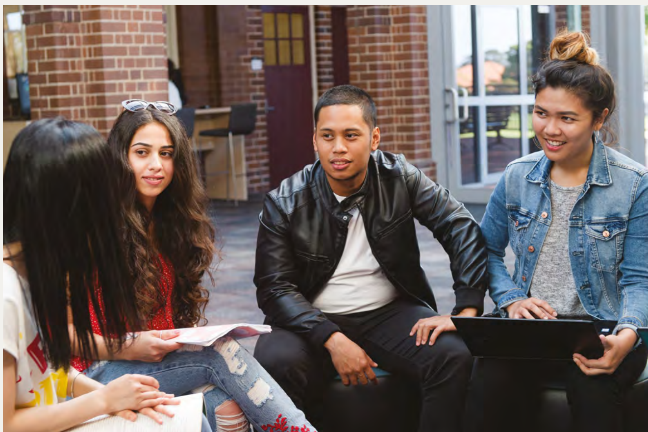
ACU Strathfield Campus

Further information: For the latest information about this course, please refer to: acu.edu.au/courses/gdp