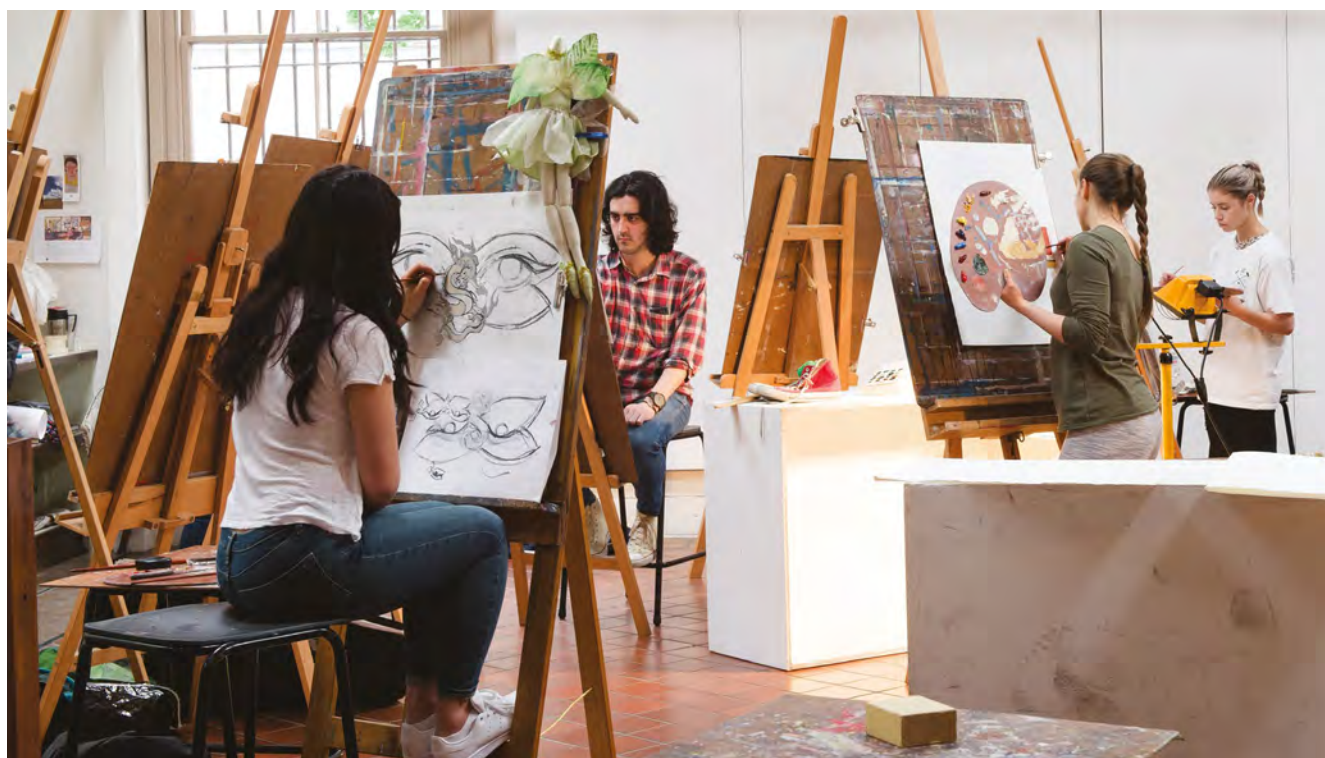
ACU Melbourne Campus

Further information: For the latest information about this course, please refer to: acu.edu.au/courses/dvad