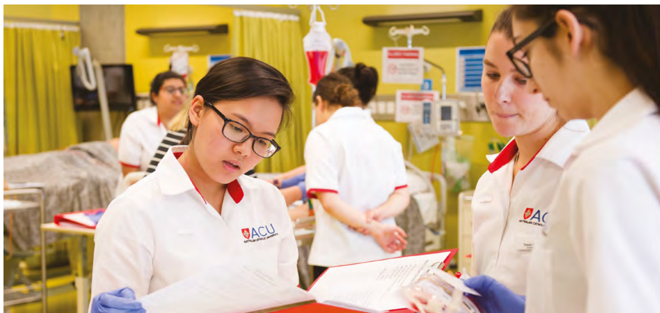
ACU Melbourne Campus