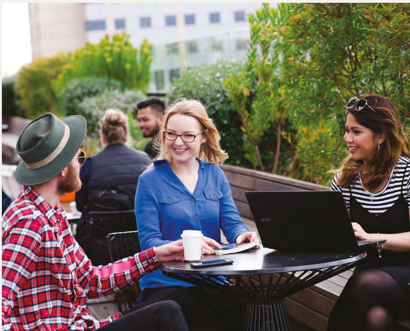
ACU Melbourne Campus

Note: As this program is delivered in intensive mode, international students will need to contact the ACU International Admissions team to confirm an appropriate start date before applying (see back cover for contact details).