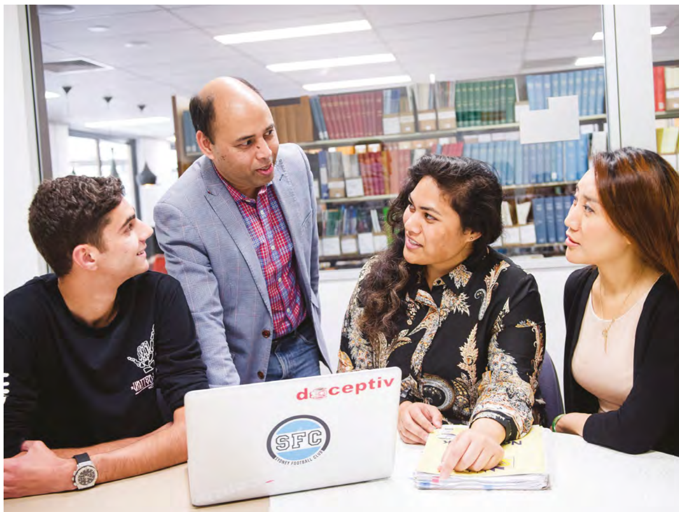
ACU North Sydney Campus

Further information: For the latest information about this course, please refer to: acu.edu.au/courses/dc