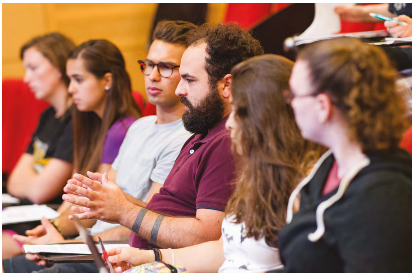
ACU Brisbane Campus

Further information: For the latest information about this course, please refer to: acu.edu.au/courses/btbp