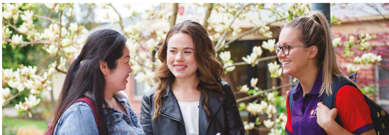
ACU Ballarat Campus