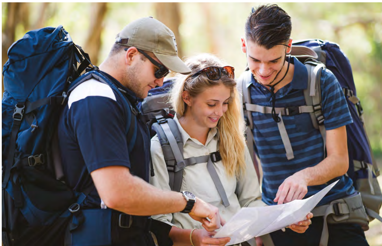
ACU Brisbane Campus

Further information: For the latest information about this course, please refer to: acu.edu.au/courses/bsoe