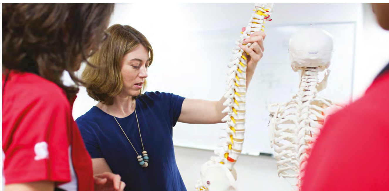
ACU North Sydney Campus

Further information: For the latest information about this course, please refer to: acu.edu.au/courses/bbsbba