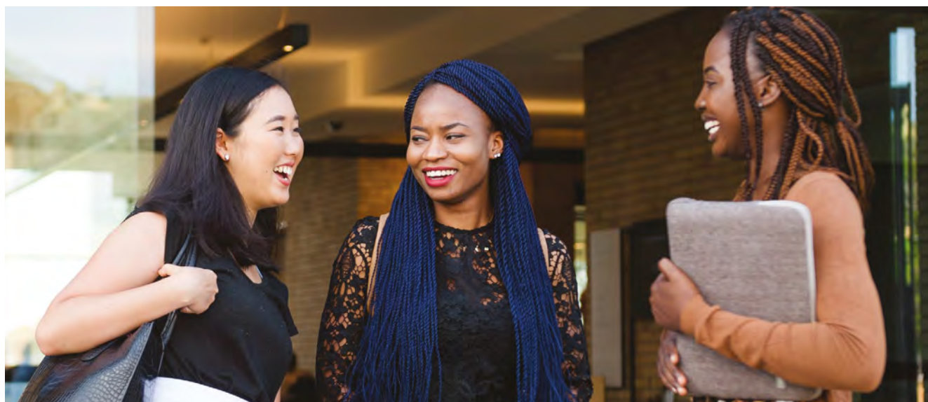
ACU Brisbane Campus