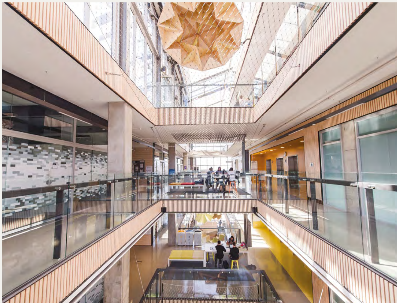
ACU Melbourne Campus

Further information: For the latest information about this course, please refer to: acu.edu.au/courses/gdph