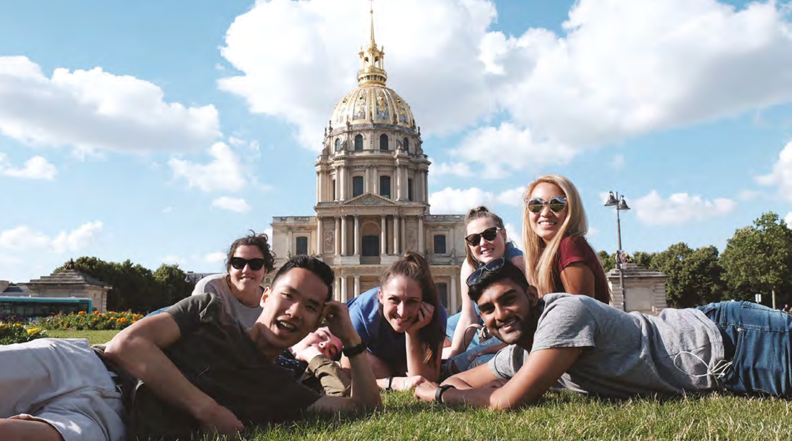
ACU students, International Core Paris