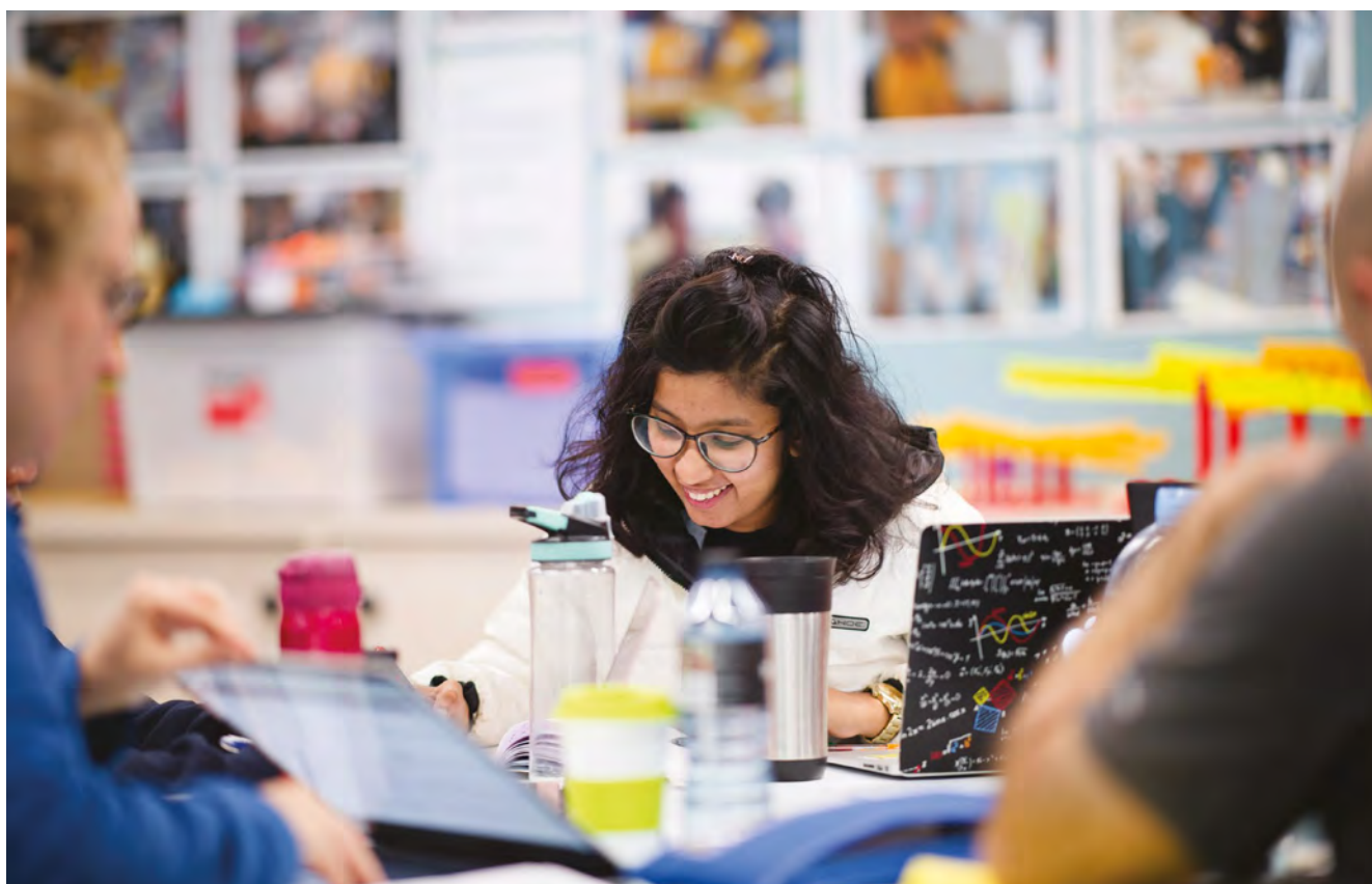
ACU Melbourne Campus

Further information: For the latest information about this course, please refer to: acu.edu.au/courses/bids