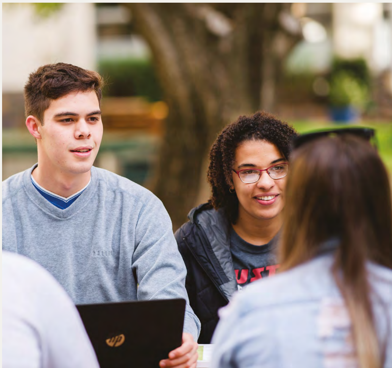
ACU Canberra Campus