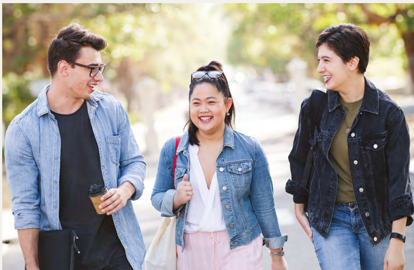
ACU Strathfield Campus