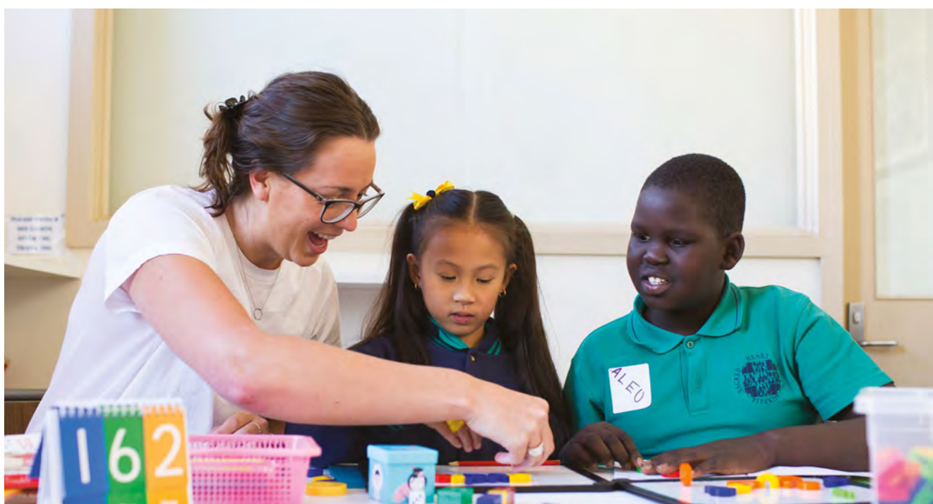
ACU Melbourne Campus