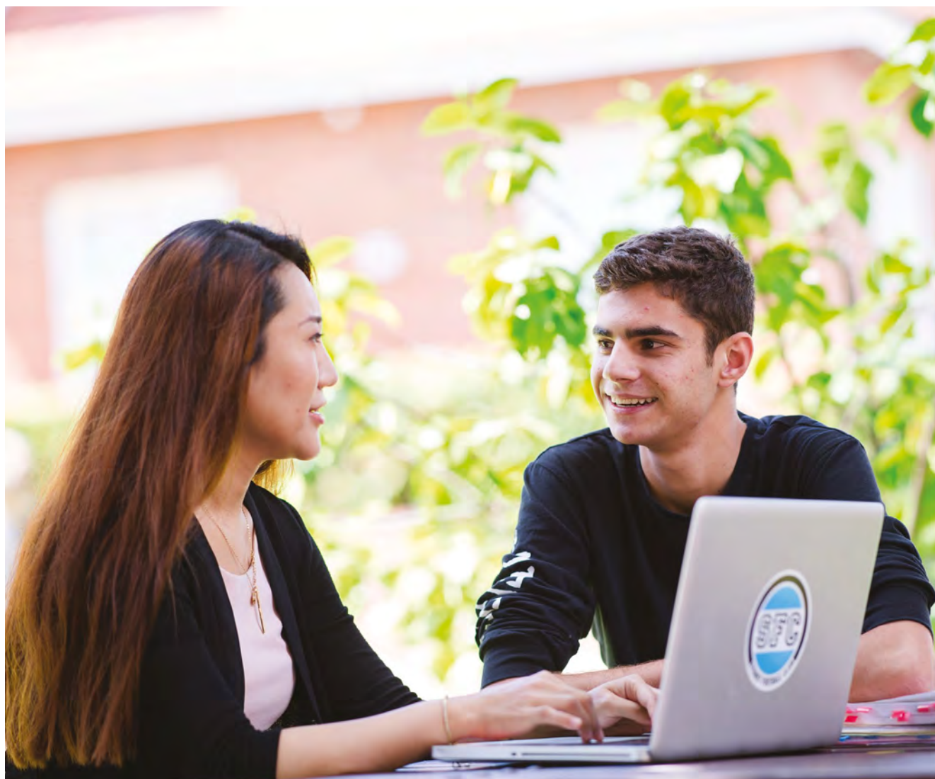
ACU North Sydney Campus

Further information: For the latest information about this course, please refer to: acu.edu.au/courses/dbis