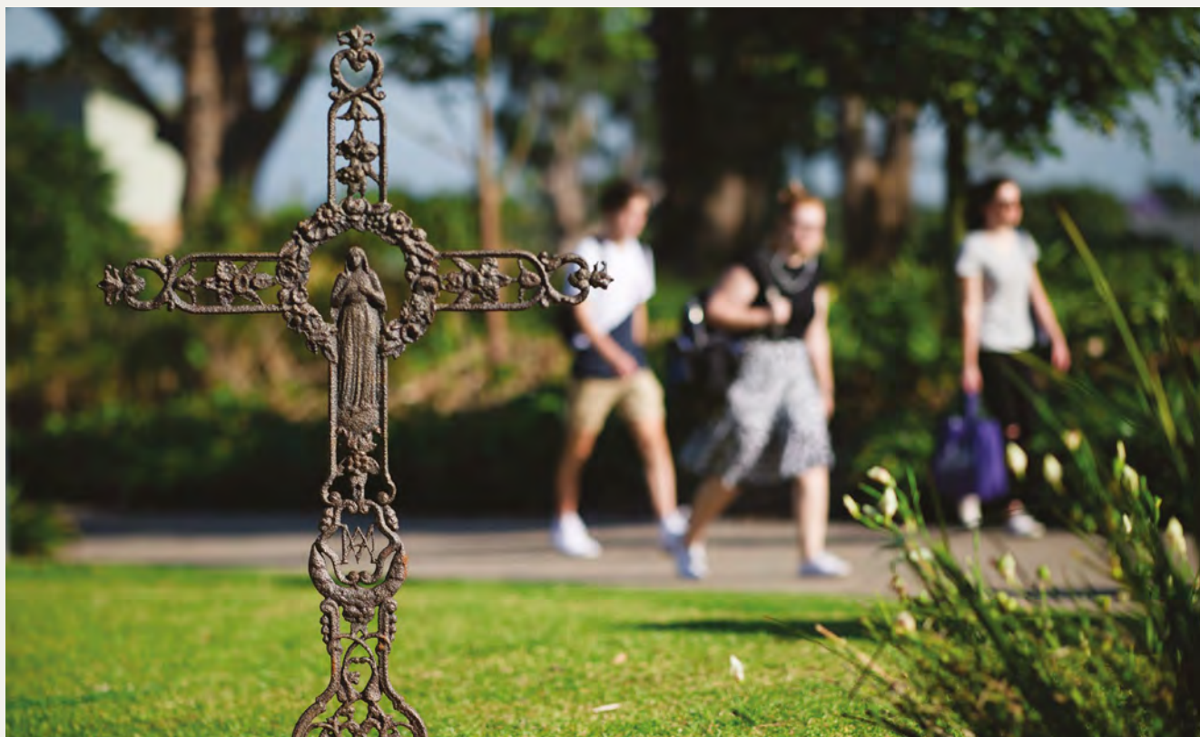
ACU Brisbane Campus

Note: For further details on application requirements and instructions on how to lodge your application, see acu.edu.au/how-to-apply/international-research-students