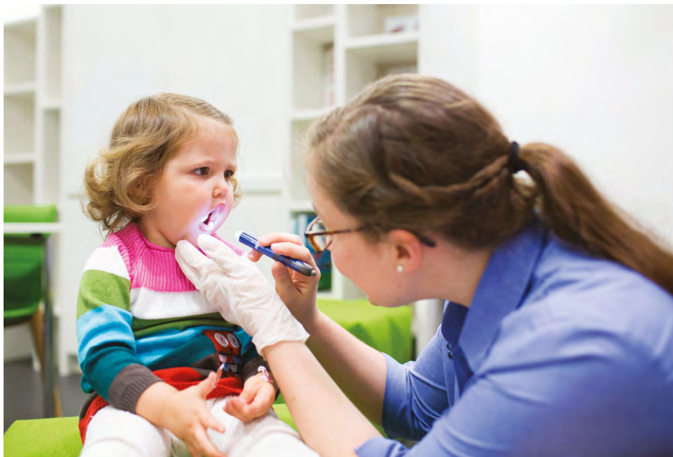
ACU Brisbane Campus

Further information: For the latest information about this course, please refer to: acu.edu.au/courses/bsp