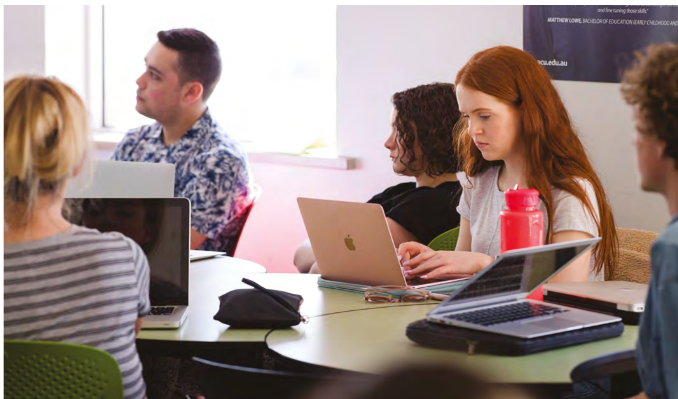
ACU Melbourne Campus

*Campus availability: Students will undertake global studies units at the Strathfield Campus and all other units at the North Sydney Campus.