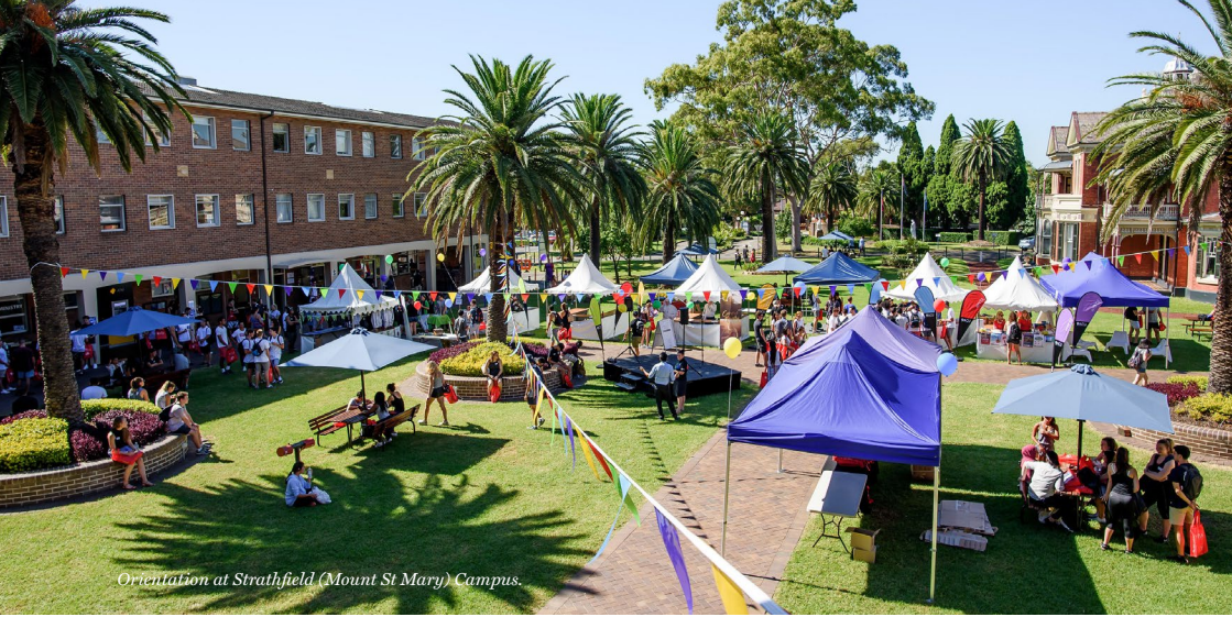
Orientation at Strathfield (Mount St Mary) Campus.