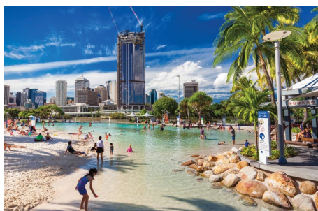
Left: Bondi Icebergs (Sydney, NSW). Top right: Flinders Street Station (Melbourne, VIC). Bottom right: Southbank (Brisbane, QLD).