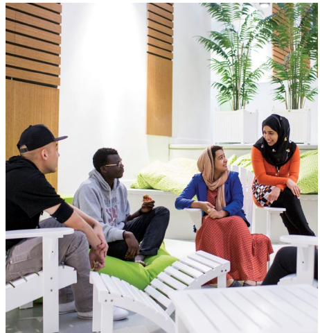
Students at ACU's Miguel Cordero Residence, Camperdown NSW.

Internet access is available at all campuses. Some accommodation will already have arrangements in place to enable internet access and you will probably be charged for using this. Most students prefer to arrange to have their own broadband, cable or wireless internet connection. A good place to start when comparing internet service providers is: broadbandguide.com.au