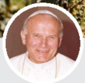
St John Paul II