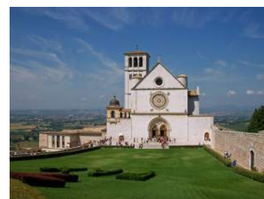
The Basilica di San Francesco of Assisi