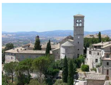
Santa Maria Maggiore Basilica