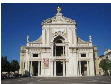
Santa Maria degli Angeli