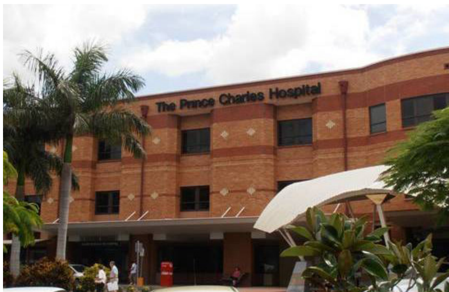
The Prince Charles Hospital