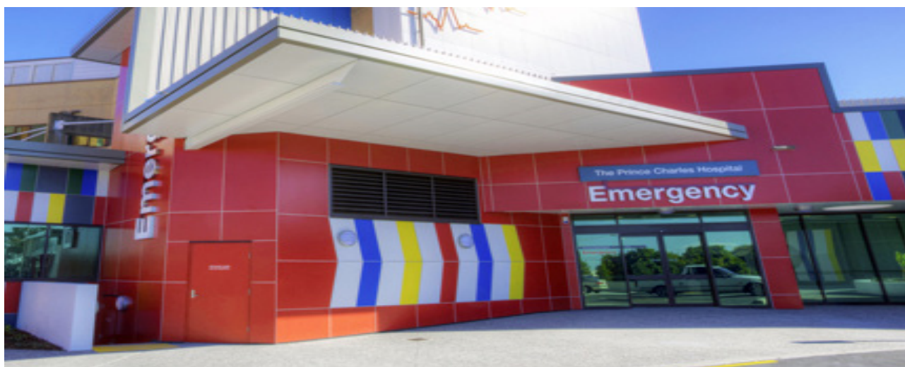
Emergency Department TPCH