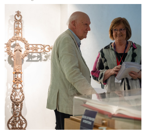
SC@60+Symposium\ Mass\ (Gribben\ and\ Murrowood)