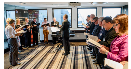
Choir and Guests at Official Opening of ACU Centre for Liturgy at ACU North Sydney Campus in 2016.