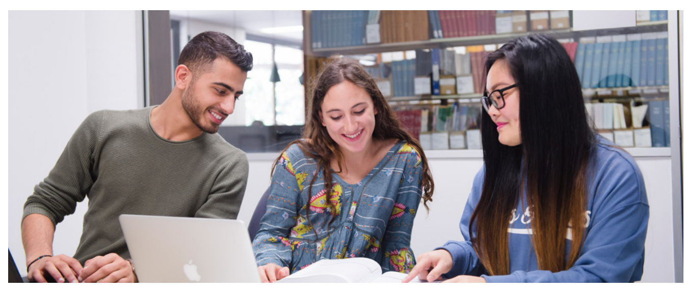
ACU North Sydney