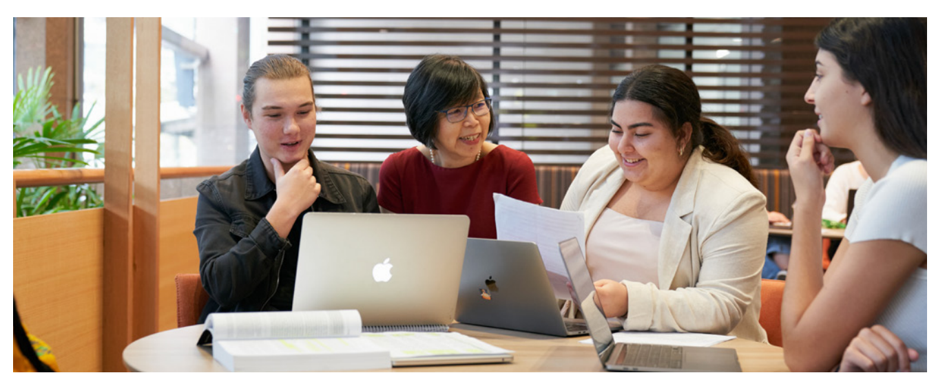
ACU North Sydney