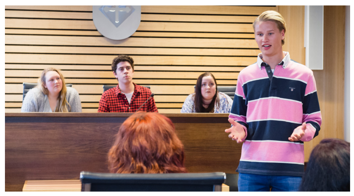
Moot\ court, ACU\ Melbourne

\ensuremath{^*\mathrm{This}} is an example course outline only.