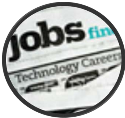
Careers at ACU