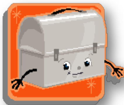
Lunch Box Session – PDP for General Staff