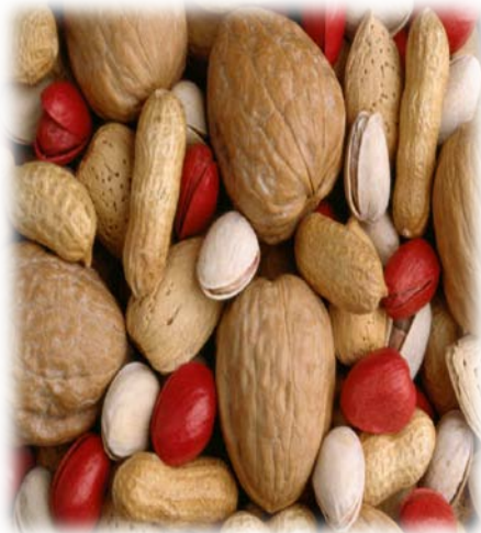
Supercharge your peanuts

Roasting amped up the antioxidants in the peanut skins even more than in the peanut flesh, so shop for ones with the skins on. Some debate continues regarding the health benefits of raw versus roasted nuts, but in any form, they're still packed with good-for-you nutrition. Just limit yourself to a handful or two a day, because they're also high in calories.