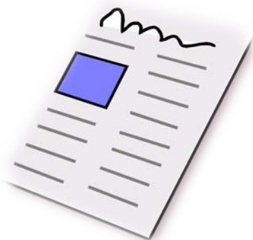
Previous HR Matters

On Monday take a moment to think about the women who have inspired you, whether it be your mother or another relative, and/or a teacher, colleague, friend or historical figure.