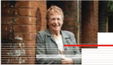
left to right: The Brisbane Campus choir