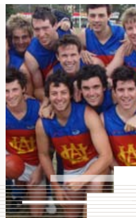
The University's AFL team at the Australian Universities Games