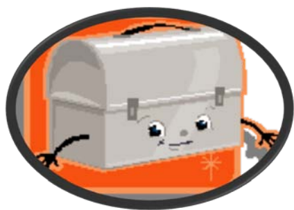
Lunch Box Session