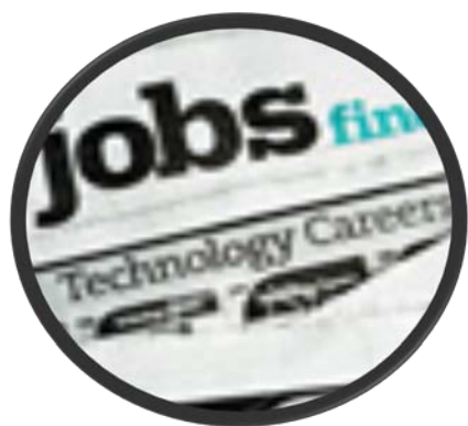
Careers at ACU