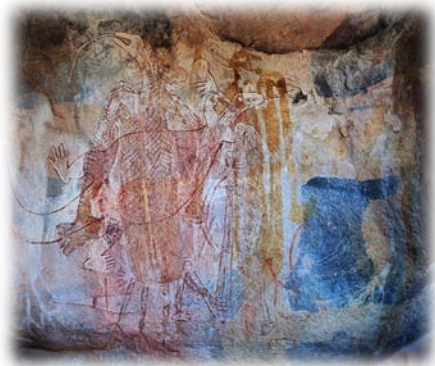
Indigenous Week Activities at ACU