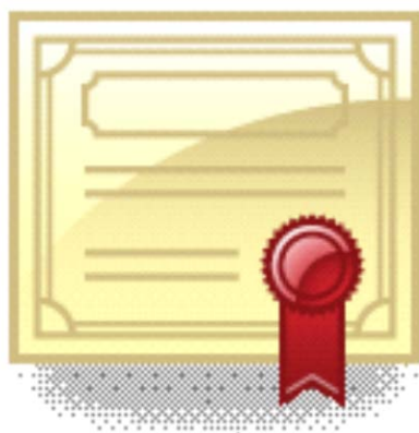
Certificate IV in Frontline Management

Invitations for applications for this scholarship will be sent out early August 2009.