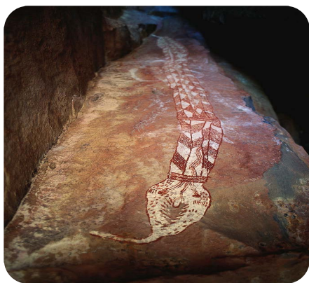
Indigenous Week Activities at ACU