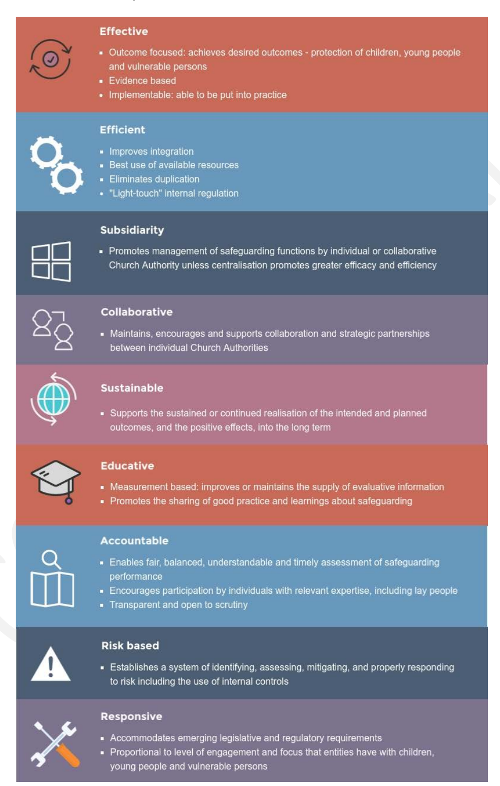
Figure 2. Design principles for operational model

Together with the Safeguarding Steering Committee, ICPS developed these nine principles for design of a safeguarding and professional standards operational model for Catholic Entities in Australia. It needs to be effective, efficient, subsidiarity, collaborative, sustainable, educative, accountable, risk-based, and response.