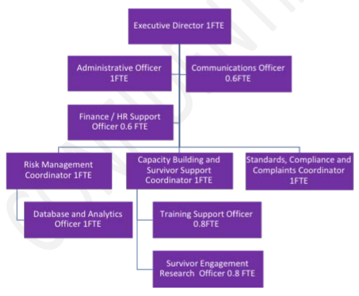
Figure 4. Proposed staffing structure for the National Office

The following is the proposed staffing structure and per annum costs for the National Office.